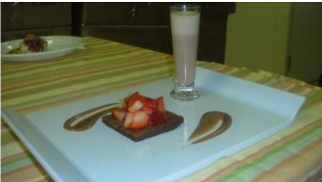
Chef Kunal Chakrabarti's impressive dessert With hot chocolate

The Culinary Team recently prepared lunch for the employees of Merchants Market, one of their sponsors.