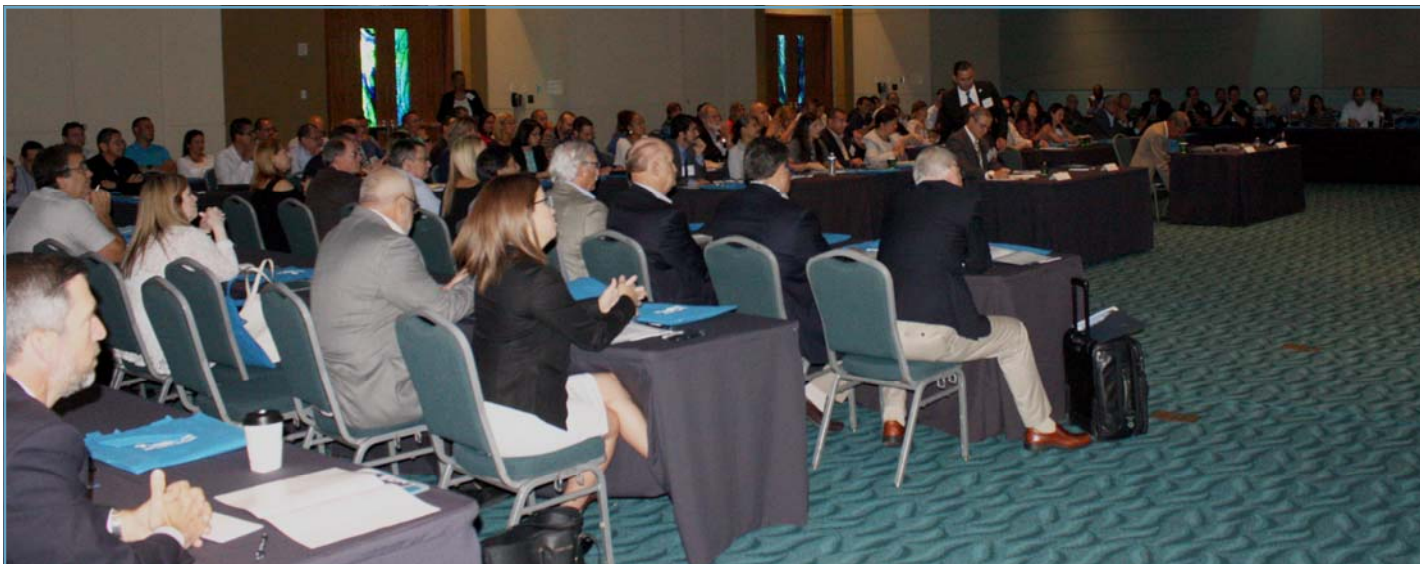
Participants filled a room in the PR Convention Center to attend the Tropical Shipping 2017 Annual Disaster Management Workshop on March 29, 2017, to continue building Community Resiliency through strategic Private Public partnerships.

I n a full room at the PR Convention Center, Tropical Shipping, along with TOTE Maritime and Caribbean-Central American Action (C-CAA) hosted its 2017 Annual Disaster Management Workshop on March 29, 2017, to continue building Community Resiliency through strategic Private Public partnerships.