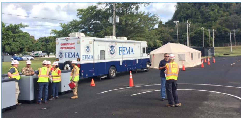
FEMA CAD Logistics staff was able to deploy the FEMA CAD DTOS (Deployable Tactical Operating System), and to stand up a "Western Shelter" as a fully operational office.

The FEMA team was able to support the loading process of generators into platforms, to deploy the FEMA