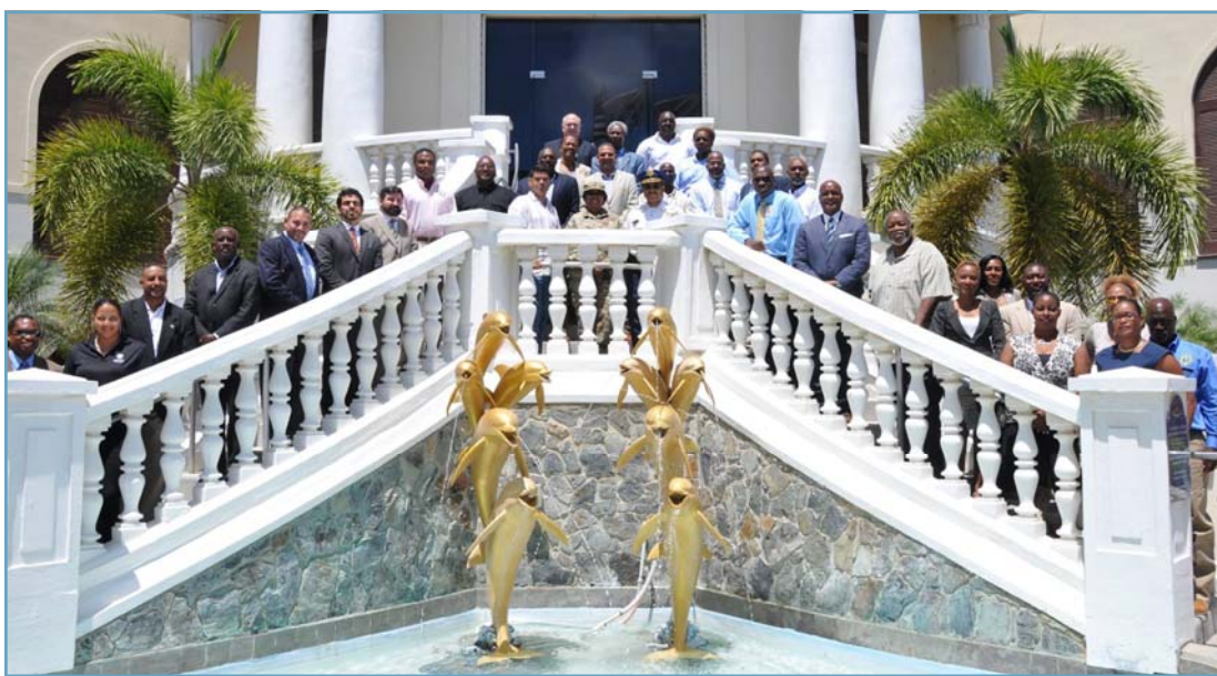
Around 30 Senior Officials, representatives from Non Government Organizations, Private Sector and others participated of the All Hazard Preparedness Workshop in St. Croix.