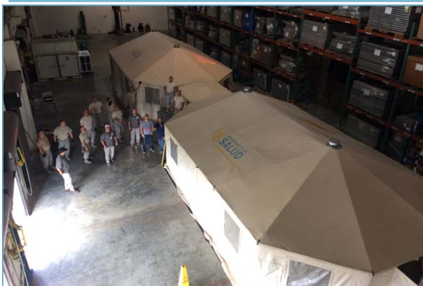
Left up: Inside this type of tent, any responding agency may conduct its operation. In this situation, USACE set up their Emergency Operation Center.

During an all-hazard response situation, a Western Shelter can provide first responders a "shelter" site solution for several emergency services, such as: emergency healthcare, law enforcement, disaster medicine, urban search & rescue, disaster mortuary, disaster veterinary, and more.