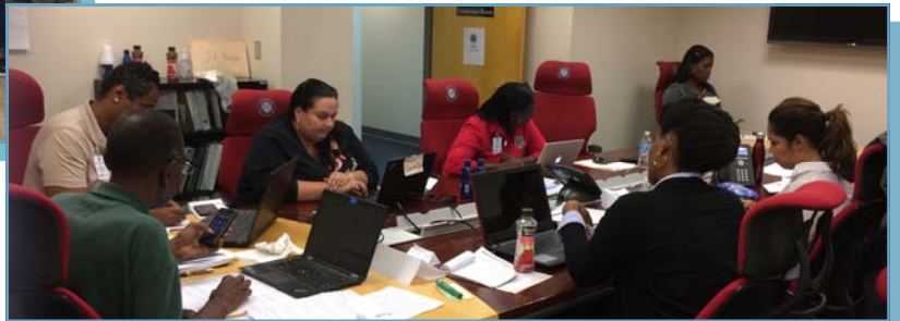
The USVI Joint Information Center disseminated information to the public and handled media inquiries, among other functions.