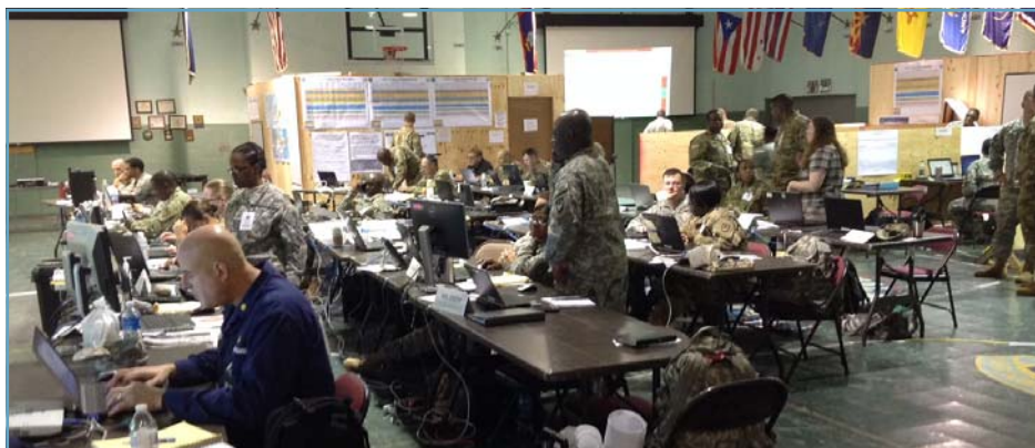
Participating personnel benefitted of having interactions before a real event, which facilitates the coordination among territorial and federal responding teams.