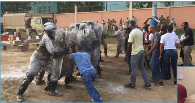
VING personnel put in practice riot control techniques to manage "impromptu" protesters in POD locations.