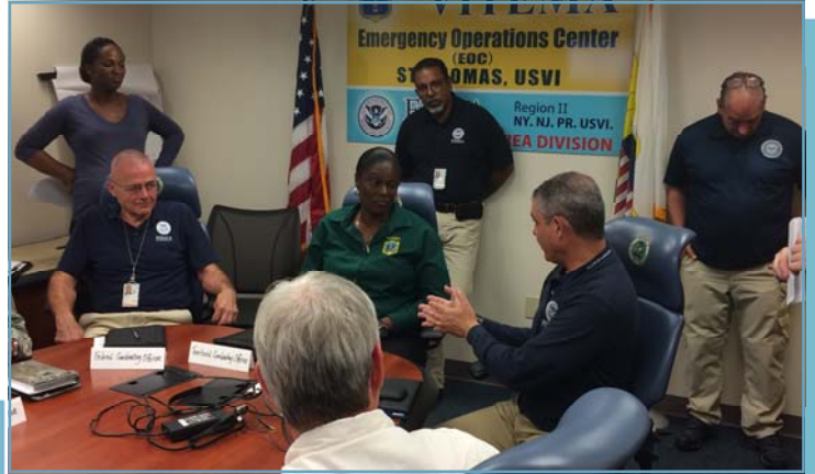
FEMA, VITEMA and DCE personnel discuss potential situations and identified resources to manage a response operation in the USVI.

The US Northern Command and the National Guard Bureau sponsor the Vigilant Guard program, which gives states and territories the opportunity to improve emergency coordination with their federal and military partners. VITEMA and the USVING lead the series of exercises that concluded with the VG 2017.