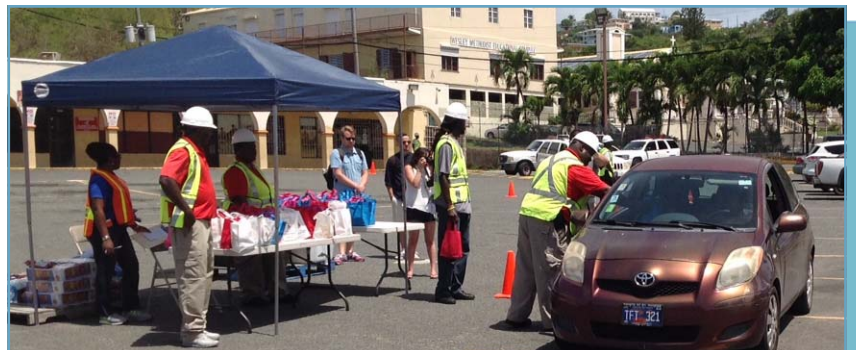
Territorial and Federal authorities established Points of Distribution to hand commodities to drivers in different area throughout the territory.