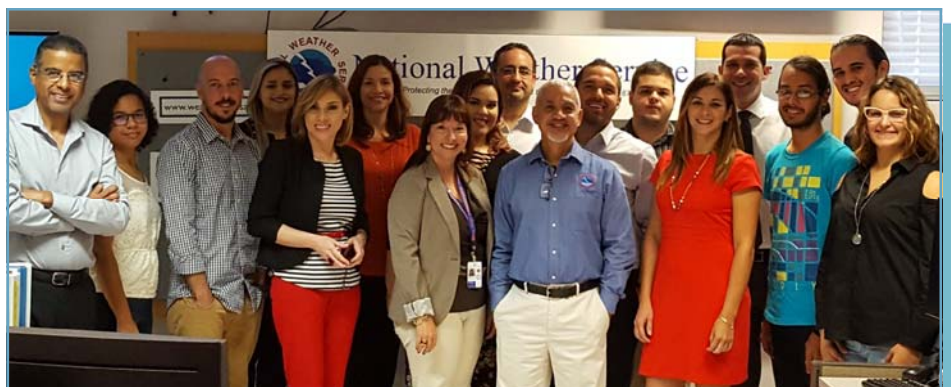
Representatives from different Puerto Rico media outlets, Public Information Officers from PREMA and FEMA; several Science, Medical Science and Public Communication undergraduate and graduate students participated of this year workshop.

Representatives from different Puerto Rico media outlets, Public Information Officers from PREMA and FEMA; several Science, Medical Science and Public Communication undergraduate and graduate students participated of this year workshop.