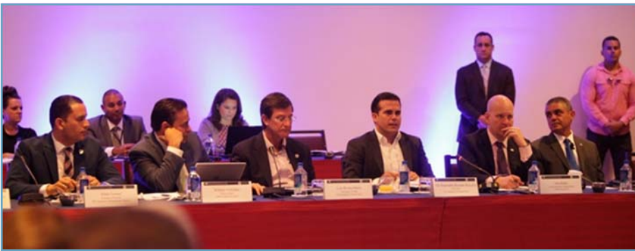
PR Governor Ricardo Rossello-Nevarés and his Cabinet actively participated of the roundtable discussions during the Seminar. These discussions sought the identification of homeland security issues, to help strengthen PR government capability to plan for, prevent, respond to and recover from catastrophic events and terrorism.

The MET, which is part of the Naval Postgraduate School (NPS) Center for Homeland Defense and Security (CHDS) conducts the Executive Education Seminars to prepare senior level state and local officials to examine, define and meet the challenges homeland security poses for state, city or urban area strategic planning, policy development and organizational design.