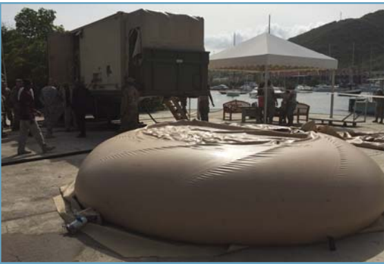
USVI National Guard deployed all type of resources to address needs identified throughout the territory.